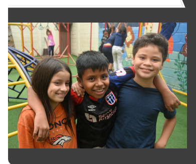
Our continual goal is to provide targeted solutions in supporting the unique needs of each family.