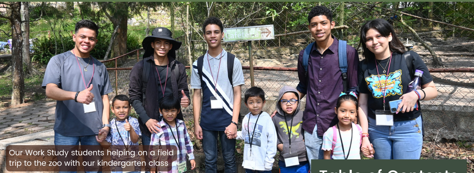
Our Work Study students helping on a field trip to the zoo with our kindergarten class